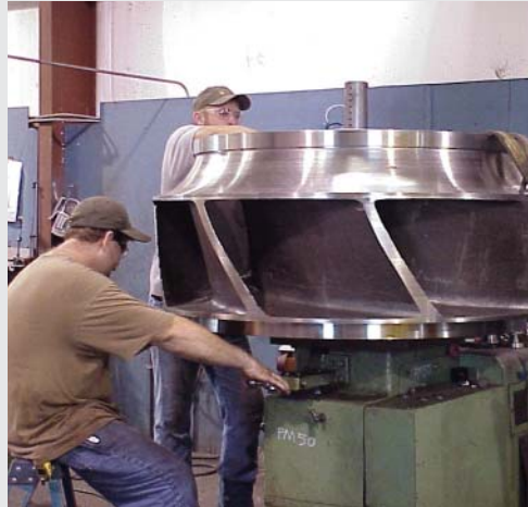
60" Foster Wheeler Circ Water Impeller

is a complete service company established in 1975, dedicated to supplying new, quality replacement parts for power generation equipment. With design and machining facilities located in Zachary, Louisiana and foundry services located in Cullman, Alabama, the ProCast Group assures the fastest possible response to the needs worldwide.