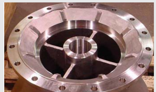
Johnston Suction Bowl