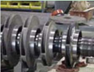
DeLaval Element - Boiler Feed

As part of ITT Industries, the largest pump company in the world, we have access to experts in the industry to troubleshoot, re-engineer, design and test, almost anything in the Power Industry, anywhere in the world.