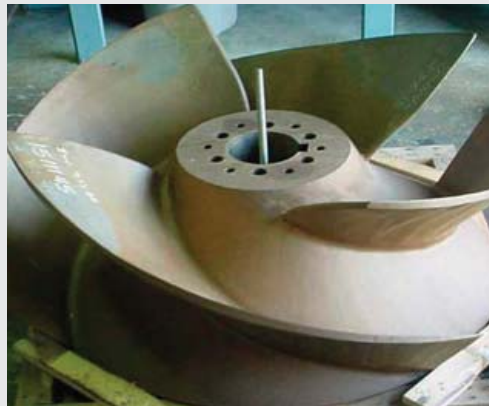
Flowserve Circ Water Impeller