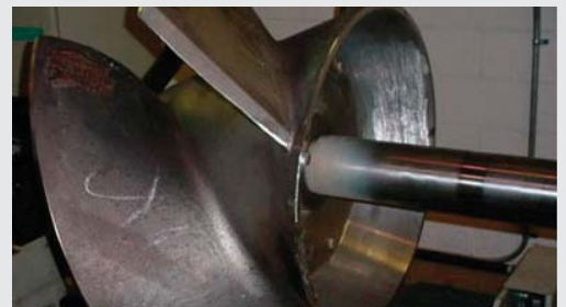
C.H. Wheeler Impeller

When you have been in the industry as long as we have and own premier brands such as Goulds Pumps and ITT A-C Pump, you know pumps. We have metallurgists to select the right materials, designers to make your pump better than new, and access to technology that guarantees your part will fit and perform up to your expectation. We have the expertise to make it happen for you.