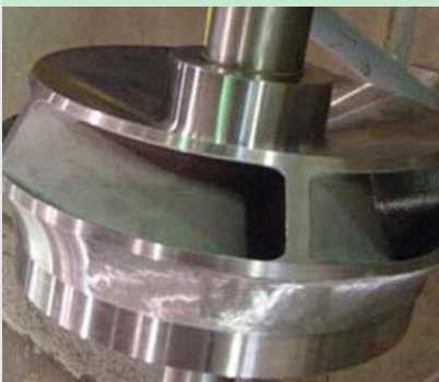
Ingersoll-Rand Impeller Condensate Service