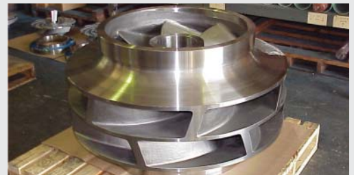
Ingersoll-Rand Cooling Tower Pump Impeller Upgraded From Bronze To CD4MCU Material To Resist Aggressive Water Chemistry and Cavitation.