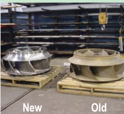
60" Foster Wheeler Circ Water Impeller Shipped in (3) Weeks. Material Upgraded to 316SS.

Rapid manufacturing to ISO standards, we want to make sure you stay our customer. Our quality isn't a sign on the wall, it's a promise.